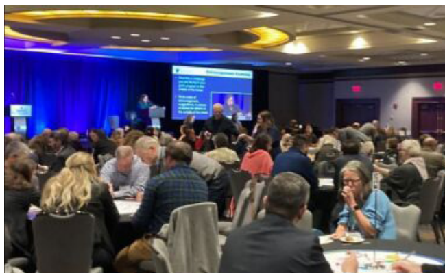
Grantees gather each spring to build connections and share learnings.